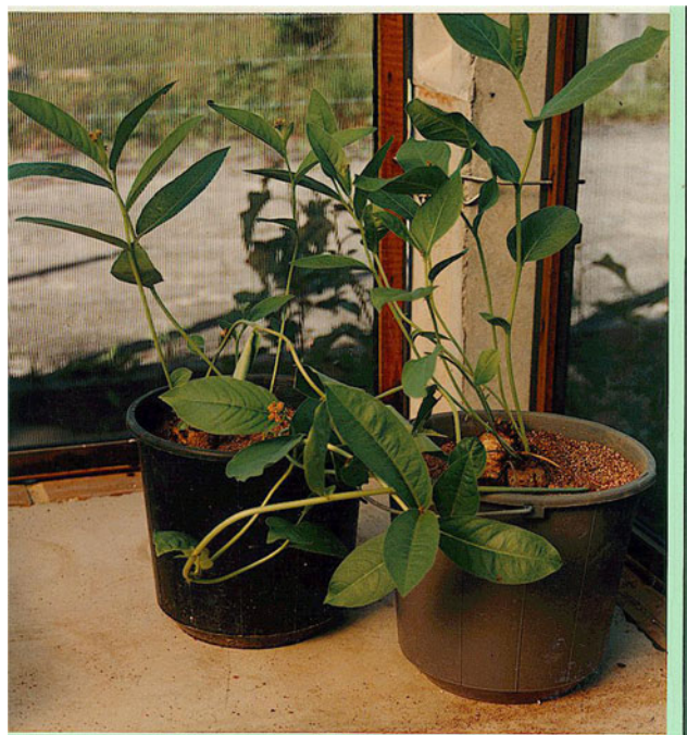
Fig. 1 Jatropha elliptica (Pohl) Muell Arg. cultivated in greenhouse

In the present paper, we report the evaluation of schistosomicidal, miracidicidal or cercaricidal activities against Schistosoma mansoni and/or molluscicidal activity