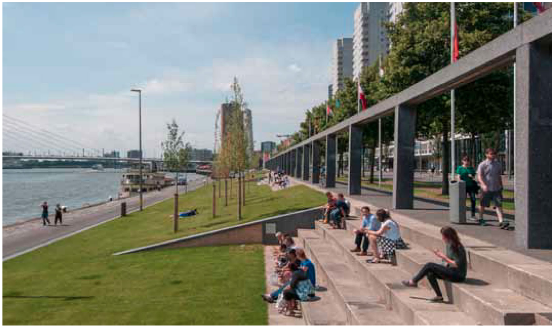
Fig. 2 View of Boomjeskade in Rotterdam. The impermeable pavement of the riverbank was replaced with grass creating a soft infrastructure for flood buffering that at the same time serves as a green space for people to use. (Photo: Gemeente Rotterdam 2013; authors’ adaptations and editing)

visions can directly relate to improving the city via specific projects. With this tendency to focus on action, there is a risk of losing the trail from the vision to the action when there are no trail keepers in the city’s planning process that remain to their position on the long term. The different projects that bring to life the visions that have been formulated have a project-management horizon. As thus, it is often the case that there is limited ownership of some of these projects due to project teams assembled on project basis. This results in diminishing knowledge on how each project relates to the overall vision for the city.