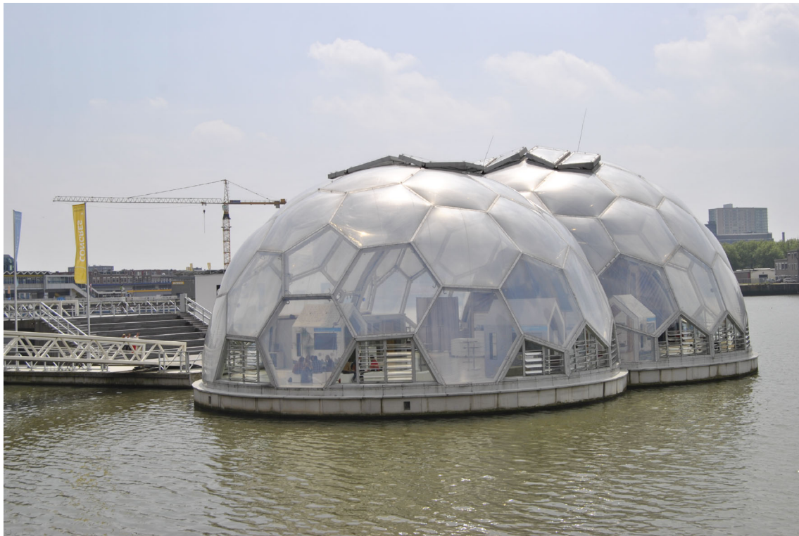
Fig. 4 Floating pavilion in Rotterdam’s city ports. An experiment of floating urbanization

citizens and as such have less social value. At the same time, the locations with great social potential if restored into green areas do not yield water retention benefits due to their location. As such, there are few locations that these two objectives can meet (e.g., using green space as a water retention area) with the majority of small-scale locations to be competition spaces for implementing climate adaptation measures or urban sustainability measures (e.g., multi-functional spaces to meet multiple socio-ecological needs).