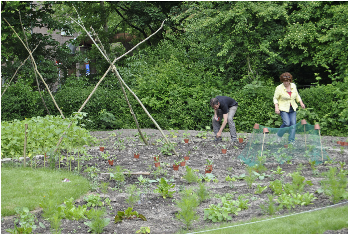
Fig. 3 Urban agriculture initiative in Rotterdam city (Photo: authors, June 2013)

research outputs about climate adaptation and mitigation as well as considering environmental quality improvements. There is a plethora of plans about climate change adaptation (e.g., floating pavilion, Fig. 4), urban green planning (e.g., restoring green riparian areas), restoration of neighborhood areas into more welcoming and green spaces (e.g., placing trees and green lawns on top of sealed squares), as well as a sustainability agenda and monitoring scheme of the city and its districts. Ongoing plans and strategies are disconnected and synergies between activities and in situ plans are neither addressed nor exploited. The reason is voiced to be the lack of information sharing between the different departmental teams within the city administration that further hinders coordination.