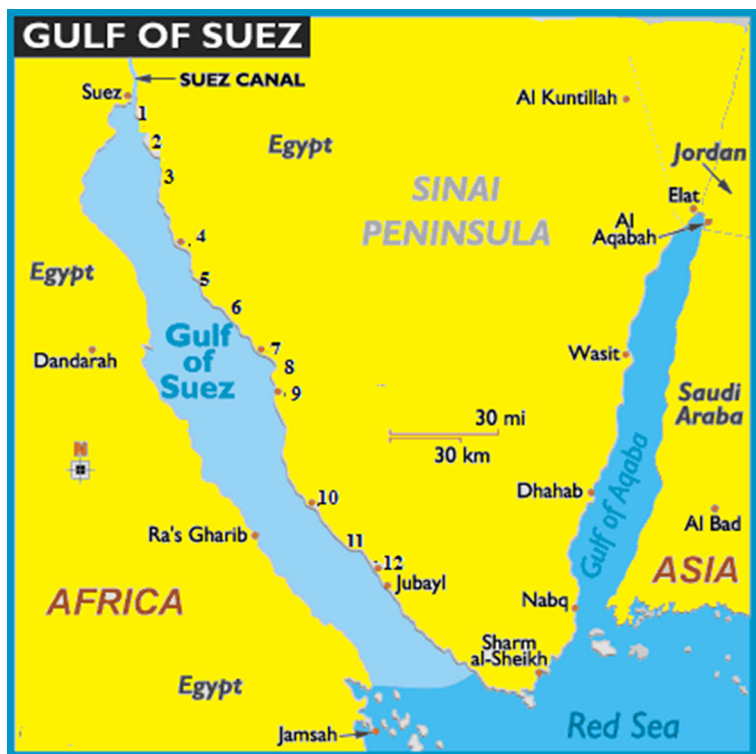
Fig. 1 Positions of the sampling stations (1–12)

Water samples were seasonally collected using Ruttiner bottles from the sub-surface waters of different 12 stations during autumn of 2012 (November) and winter (January), spring (April), and summer (August) of 2013 (Fig. 1). Cell abundance and composition of phytoplankton were estimated according to sedimentation