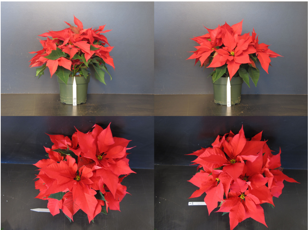
Fig. 1 Poinsettias grown in peat-ADDF-perlite ( left ) or peat-perlite ( right )

PourThru samples from pots containing peat-ADDF-perlite had greater phosphate-P concentrations than those of the control plants for approximately 5 weeks (Fig. 2). The continued release of P may be from the dissolution of calcium phosphate minerals, which are often found in dairy manure and dissolve at pH below 7 (Shober et al. 2010).