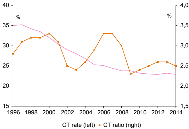
Fig. 1 European Union: trends in corporation tax rates and ratios 1995–2014. Calculations are based on simple arithmetic averages

should be calculated on an accretion basis, 11 in practice taxable profits are determined on the basis of International Financial Reporting Standards (IFRS), which is the European-wide rule since 2005 for corporations listed on EU stock exchanges. The accounting principles prescribe that revenues and costs should be matched on an annual basis under the accrual system of accounting. The costs of raw materials, intermediate products and wages, as well as expenses, including interest, are deductible if incurred in earning taxable profits and in maintaining the assets used in the corporation's activities. Potential losses are taken into account in computing taxable profits, but accrued capital gains are not taxed until they are realized.