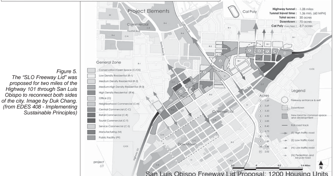
Figure 5. The "SLO Freeway Lid" was proposed for two miles of the Highway 101 through San Luis Obispo to reconnect both sides of the city. Image by Duk Chang. (from EDES 408 - Implementing Sustainable Principles)