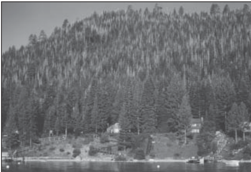
Figure 1. Property values in the Lake Tahoe Basin are jeopardized by the high tree mortality on private and public lands.

Under natural conditions, fire would have thinned these stands and provided natural regeneration. However, a century of urbanization has forced