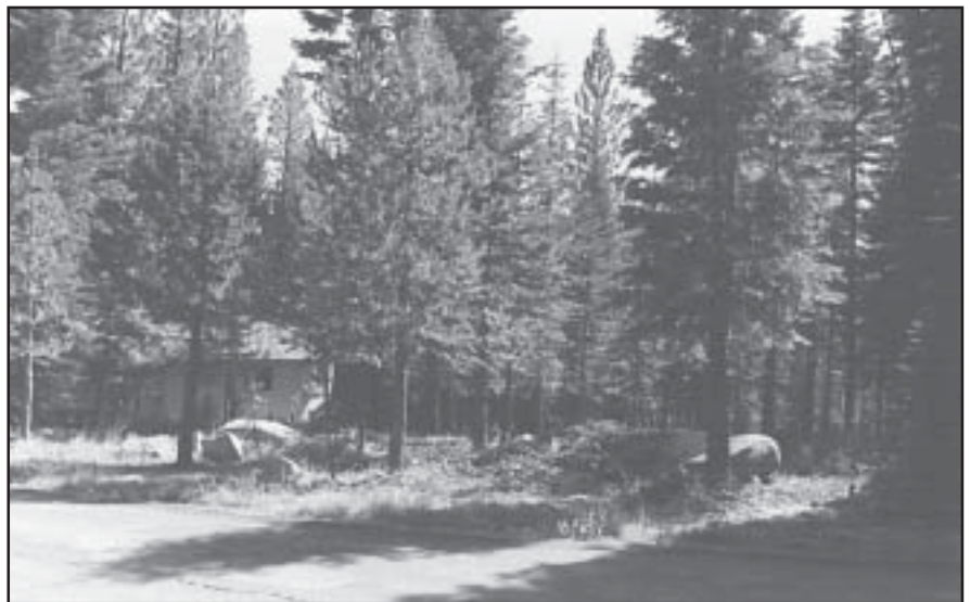
Figure 4. The same property in Figure 3 after prescribed value-enhancing thinning (similar view angle).