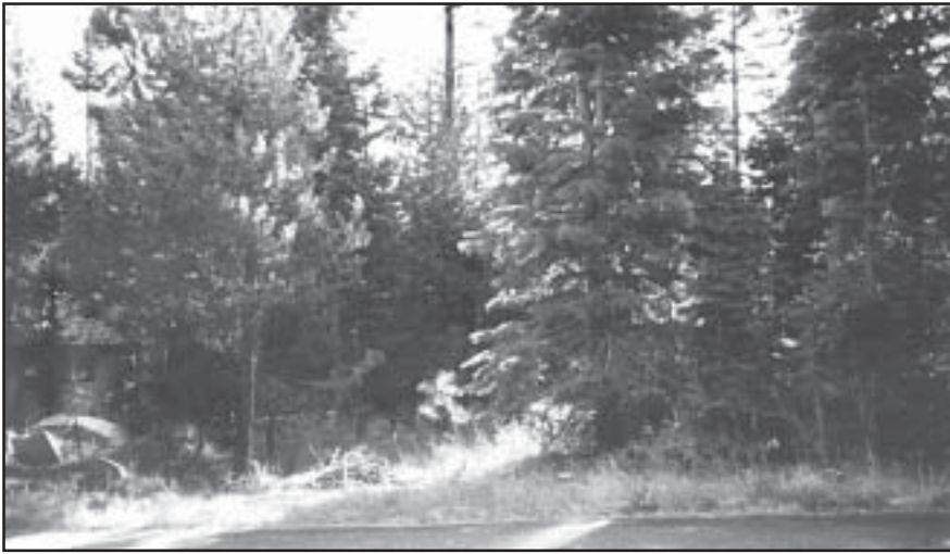
Figure 3. A typical LTB property in need of arboricultural treatment.

health do not arise solely from the aesthetic effects. Fire risk in the Lake Tahoe Basin, like many urban interface areas in the U.S. west, has become widely recognized by residents recently, and markets may reflect the benefits of reduced fire risk from managed improvements. Such benefits, however, are inherently jointly produced from proper tree and stand care.