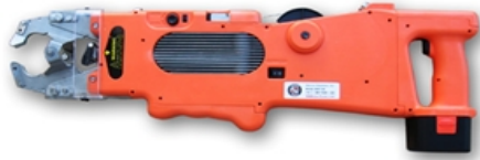
Rebar tying tool

making it easier to get into hard to reach places. The rebar-tying tool is a great addition on the job site to get fast rebar ties.