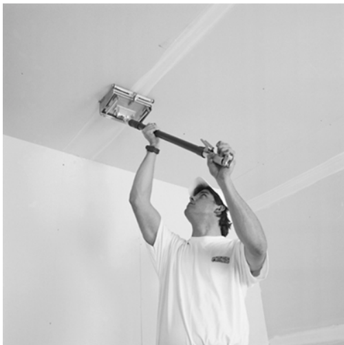
Spring assisted drywall finishing tool

To prevent upper extremity injuries on the job site it is necessary to buy the right materials for employees. Many contractors use flat and corner mudboxes in order to finish drywalls, but these tools require a lot of force and strength. This force causes fatigue as well as injuries in wrists and arms. By using a spring assisted finishing tool, it will eliminate most of the force and pushing employees have to do. It cuts down the strain significantly reducing the number of injuries.