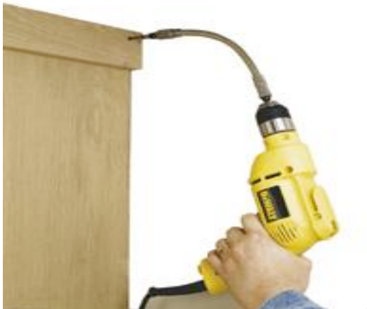
Bit Extension Shaft

To decrease the chances of having workers become injured in this category, it is important to purchase the right equipment to provide the best safety. One such tool is a bit extension shaft. This tool attaches to a drill in order to allow for a variety of unique drilling and easy accessibility to hard to reach screws. This extension shaft permits the arms to stay closer to the side and allows for the use of the bicep muscle instead of the shoulder. The reduction in stress on the arm, neck, shoulder and back is essential in injury reduction. Although the strain of looking up can become harmful to the neck, it should be done carefully in order to not bring about this problem.