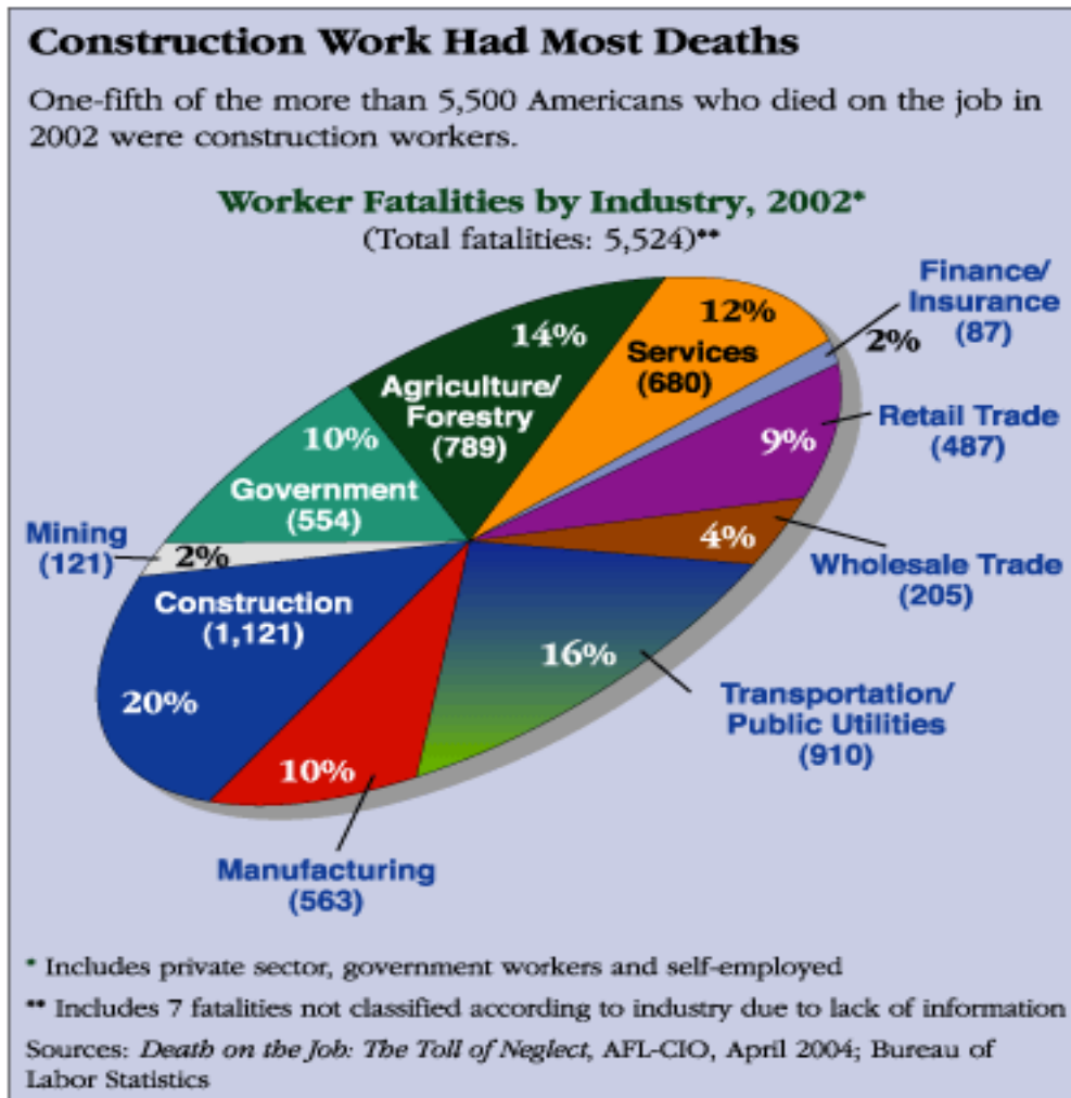
Figure 1: Fatalities classified according to industry

The construction industry is one of the most dangerous fields in the United States. Often construction workers experience injuries and fatalities on the job. In 2002, the construction industry had 1,121 deaths, which gave it the top ranking of any line of work (Hatch, 2004). Figure 1 displays the distribution of fatalities according to industry.