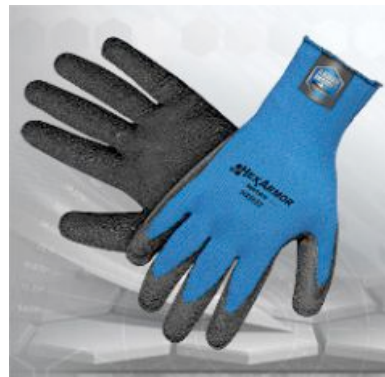
Palm and finger coverage gloves

Construction workers need cutting tools to perform various activities on the job site. In order to have a safe cutter, the workforce should be using cutters that have an automatic relock spring as well as guard protection from the blade. These cutters would be best if they were able to be used by either hand making it easier for workers that are left handed.