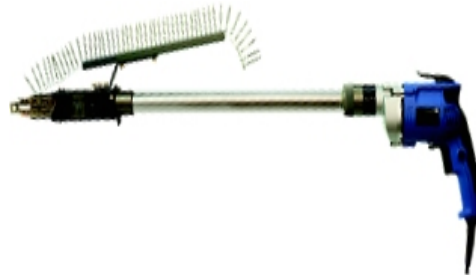
Stand-Up Screw Gun

The stand up screw gun is another alternative to reducing lower back injuries. The stand up ability allows for the reduction in lower back injuries. This tool allows for consistent screw depth and strength to provide steady screws each time.