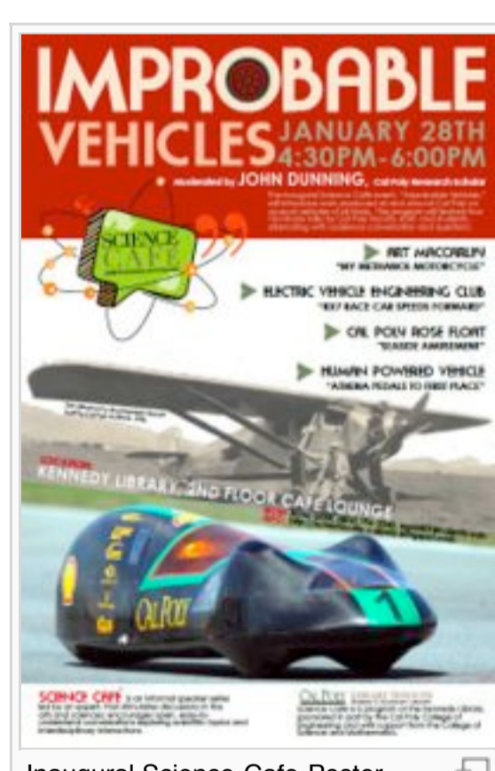
Inaugural Science Cafe Poster, designed by Kennedy Library staff.