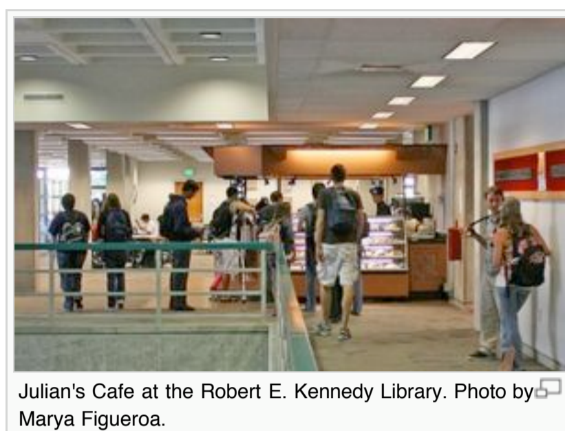
Julian's Cafe at the Robert E. Kennedy Library.

The library had long identified the second floor as a space that could be better utilized. This is where the library's existing Learning Commons desk was located, in close proximity to a number of the library's open computing labs. Adjacent to the desk there is a large, bright area with many windows. Prior to Summer 2008, this floor was filled with book stacks. It was decided that with some changes to the layout of this floor, and the addition of some important new facilities and services (described below), the second floor could evolve to become a Learning Commons in fact rather than simply in name. Strategies used included: