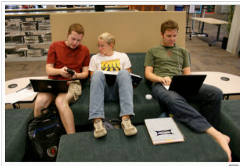
Studying in the learning commons at Robert E. Kennedy Library.

While the new study space and coffee brought in additional traffic, the library strongly felt that larger numbers alone do not necessarily represent community or foster collaboration. Our Science Café program is the next phase in our attempt to foster communication and connections on campus. A Science Café is an informal speaker series on scientific topics (defined here very broadly to encompass topics in the arts and social sciences as well), led by an expert but with a relaxed style, intended to encourage open, easy-to-understand conversations and interdisciplinary interactions. Science Café is an international phenomenon, taking place in coffee houses around the world ( http://www.sciencecafes.org maintains a list of active science cafés in the US).