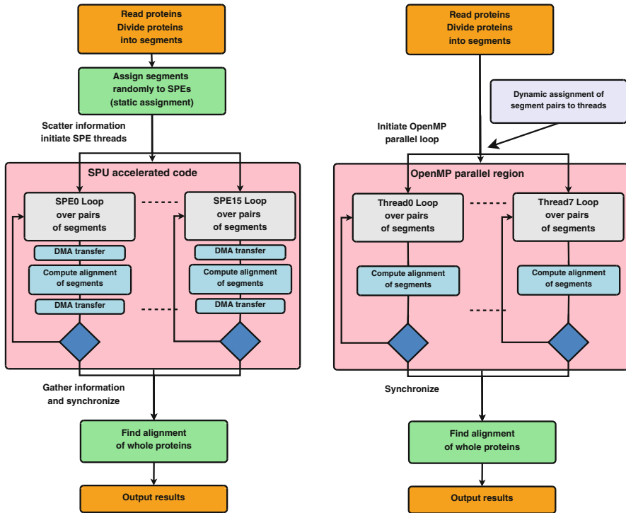
Fig. 2 The flow charts of the PowerXCell8i ( left ) and OpenMP ( right ) parallel versions of the 3D-Hit program. Important features of both implementations are indicated in the picture

\frac{1}{(1-0.97994)+\frac{0.97994}{16}} \approx 12 . The difference between observed and expected values is the most probably due to the use of built-in permutation of packages instead of actually randomly permuted set of segments. This approach increases the probability of occurrence of inefficient load balancing.