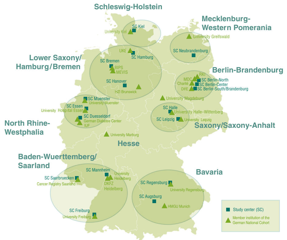
Fig. 1 Study centres of the German National Cohort, grouped by regional cluster

basic physical and medical examinations ( Level 1 ), and a random sub-sample of 40,000 participants (20 % per study centre) will participate in an extended protocol that includes more in-depth physical and medical examinations ( Level 2 ). In addition, at five MRI centres—in Augsburg, Berlin, Essen, Mannheim and Neubrandenburg—a total of 30,000 participants (drawn from the GNC participants of the respective study centres) will additionally undergo a high-resolution (3 T) MRI protocol for the acquisition of whole body, cardiac, and brain images, generating a comprehensive morphological and functional data base ( MRI programme ). The participants will either pertain to the random 20 % Level 2 sample or they will be offered the Level 2 examinations in addition to Level 1. The intensified sub-cohorts (Level 2 and MRI programme) will be used for more detailed studies on risk factors and early clinical precursor stages of diabetes, heart disease, and neurodegenerative disorders, in particular.