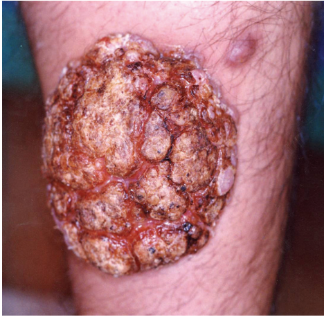
FIGURE 2: Tumoral lesion on the right shin.

Leishman bodies were seen in histiocytes, especially in the specimen obtained from the lower leg lesion (Figure 3). With regard to the clinical and histopathological findings, the diagnosis of reactivation of CL was made.