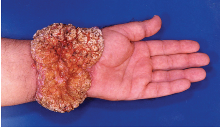
FIGURE 1: Tumoral and cauliflower-like lesion on the left wrist.