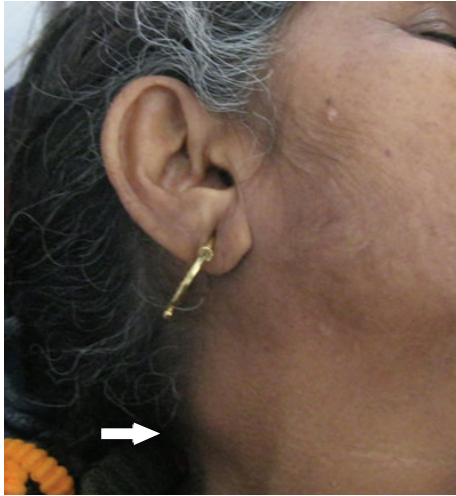
FIGURE 1: Enlarged right cervical lymph node, 2 × 1.5 cm.