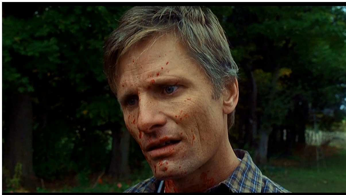
Figure 9. Tom has now fully transformed in to the grotesque Joey Cussack

face as he stands staring at his son. Spattered in Fogarty's blood and with his mouth set in an almost-snarl he is barely recognisable as the friendly family man from earlier in the film (Figure 9).