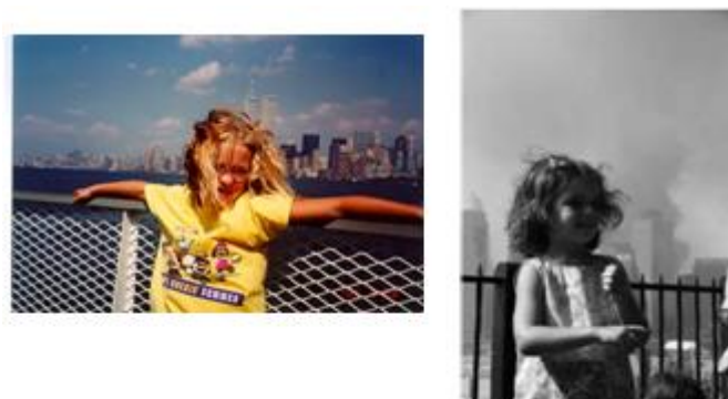
Figure 1. Two photos from digital archives depicting young girls standing in front of the twin towers.