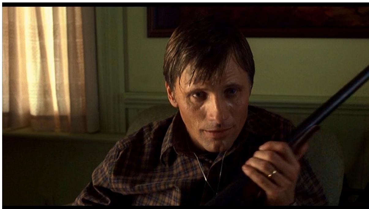
Figure 8. Tom/Joey's violent nature becomes more apparent.

time however there is no fear or surprise in Tom's expression and he now appears more than comfortable holding a weapon and contemplating its uses. The sense of foreboding that accompanies the emergence of this side of Tom's character is underscored as the scene ends by cutting to a brief shot of Jack whose face who appears alarmed by his father's out-of-character violent attitude(Figure 8).