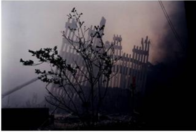
Figure 4. Discovering wilderness at Ground Zero

The landscapes I have in mind are not part of the unseen world in a psychic sense, nor are the part of the unconscious. They belong to the world that lies, visibly, about us. They are unseen merely because they are not perceived; only in that way can they be regarded as invisible. 304