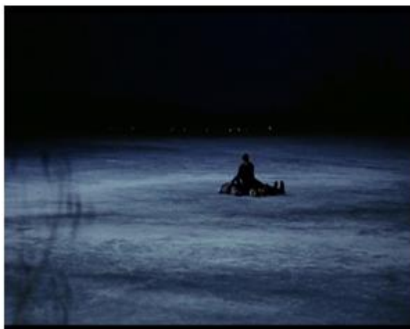
Figure 6. Joel and Clementine submit themselves to the liminal space of the frozen lake.

Clementine immediately ventures onto the ice while Joel is more cautious, worried that the ice might crack or even break. After some hesitation he joins Clementine in the middle of the river and they lay down and look at the sky. Like the beach, the frozen river offers a space outside the limits of the chaos of everyday life (just barely visible in the form of a stream of traffic in the distance) and, like the wilderness of The Road , a space which uproots the individual and suspends them within a boundless and timeless universe (Figure 6).