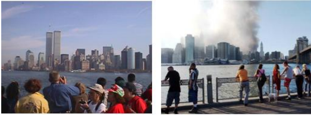
Figure 2. Onlookers mimic the tourists who took photographs of the Twin Towers as souvenirs.

The use of touristic practices to create an identification between the space of the spectator and the space of trauma can also be identified in other, more material forms of witnessing 9/11. Marita Sturken documents numerous examples of how rituals of tourism, such as visiting the site of Ground Zero and purchasing souvenirs of the Twin Towers, and argues that these demonstrate a need for the vicarious witness to establish some kind of physical connection with their traumatic experience: 'As an object purchased at the site, a souvenir offers a trace of that place, a veneer of authenticity ... The souvenirs sold at Ground Zero, and to an only slightly lesser extent around Manhattan, are thus a means of marking place, of creating connections to this highly over-determined and intensely symbolic site.' 103 Chapters two and three will explore how the trauma aesthetic constructs space very differently through concepts of placelessness and timelessness, deconstructing this spatial identification and revealing the qualities of distance and emptiness which are inherent in the vicarious experience of trauma.