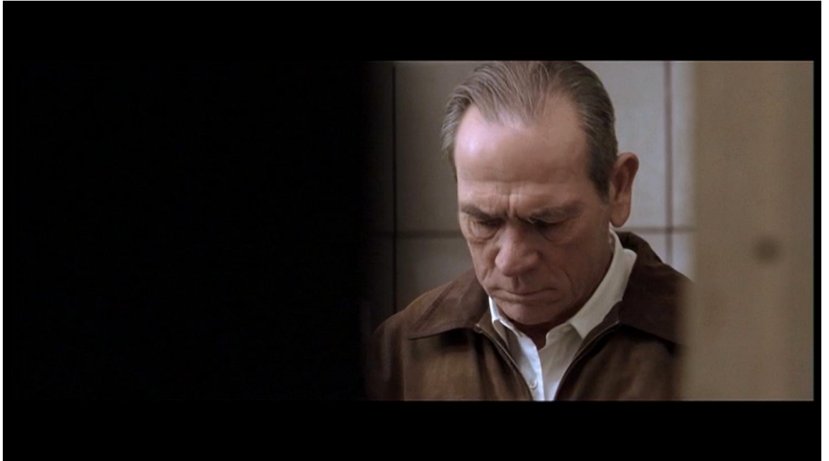
Figure 3. In the Valley of Elah draws on the visual conventions of film noir in its representation of Hank.

The use of film noir conventions in the representation of post-9/11 masculinity is, perhaps, an unsurprising one. As Frank Krutnik writes, the genre ‘seems to be driven by challenges to the mutually reinforcing regimes of masculine cultural authority and masculine psychic stability,’ and the frequent representation of ‘weak, confused and powerless males’ 170 is echoed in the characters discussed above. Comparisons can also be drawn between the cultural climate of post-9/11 America and the post-war era from which film noir emerged. Vivian Sobchack, for example identifies how films noir ‘mark to an extraordinary degree the lived sense of insecurity, instability and incoherence Americans experienced during the transitional period that began after the war.’ 171 The use of established and familiar genre and narrative conventions is common in trauma fiction as it provides a referential basis for the communication of traumatic experience that defies representation. With this in mind the familiarity of these stylistic conventions can be read as evidence of an attempt, within the trauma aesthetic, to overcome the cognitive distance between traumatic experience and representation by referencing an historical