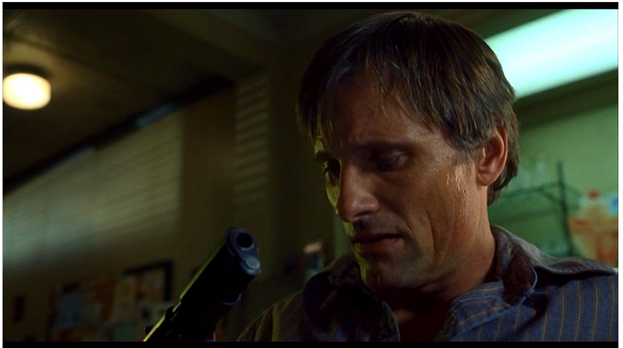
Figure 7. Tom is shocked by his capacity for violence.

This same Dorian Gray-esque transformation can be identified in three key moments in A History of Violence . The first occurs at the end of the scene in which Tom kills Leland and Billy. Propped on a stool at the counter in his diner Tom looks down at the dying Leland who gasps for breath through the blood that is pumping through the mess of his now shattered jaw. The camera cuts on a graphic close up of Leland's horrific injuries, confronting both the spectator and Tom with the devastating reality of his action, to a shot of Tom's face. Tom, out of breath and in pain, looks down at Leland and then at the gun in his hand, seemingly taken-aback by the violence of his own actions (Figure 7)