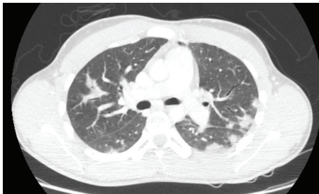
FIGURE 2: Multiple pulmonary nodules.

Oral anticoagulant was introduced secondarily. Apyrexia was obtained on the seventeenth day. Antibiotic therapy was maintained for three weeks.