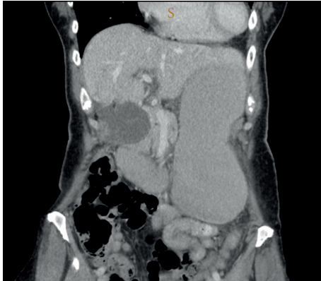
FIGURE 1: Reconstructed coronal images on computed tomography demonstrating the dilated and relatively inferiorly placed gallbladder. Acute gastric distension was also present due to duodenal compression by the very dilated gallbladder (not shown).