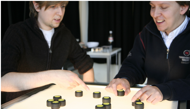
Figure 1: AudioDB can be used to discuss sounds and their interrelations.

In this paper we present AudioDB , a system to collaboratively navigate sound databases via a spatial audio-haptic setup. It provides an environment to sonically sort, group and select sounds which are represented as physical artifacts on a tabletop surface. We give an introduction and insights on implementing interactive overviews for sound databases followed by first impressions of a qualitative analysis of the system.