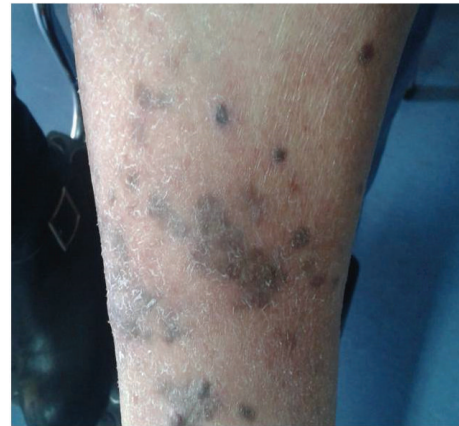
FIGURE 3: Reddish-violaceous papules, nodules, and infiltrated plaques on the legs.

2.3. Family 3. A 72-year-old female, who originated from Central Greece, was admitted to our hospital for treatment of recurrent Kaposi’s sarcoma. The disease had started 3 years earlier, at the age of 69, with the appearance of a few violaceous macules and papules on the right lateral malleolus area. The lesions were diagnosed as KS and treated with radiotherapy. Six months before admission to our hospital, she displayed a recurrence of the disease. Localized radiotherapy