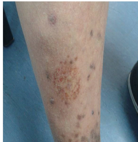
FIGURE 4: Reddish-purple lesions on the legs.

resulted in remission of the lesions. At the scheduled follow-up visit, six months later, the lesions displayed noticeable improvement.