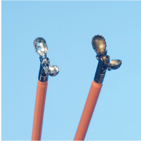
FIGURE 1: RJ4 (left) and standard large diameter forceps (right). Both are straight shaft forceps with a cup design.

jumbo forceps (Radial Jaw 3 Max Capacity Biopsy Forceps, Boston Scientific, Inc., Boston, Mass, USA. [RJ3 MC]).