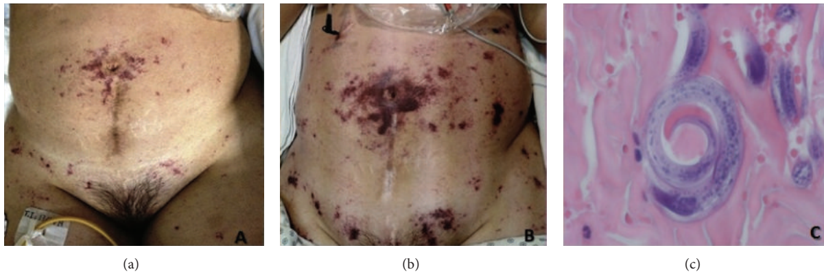
FIGURE 1: Purpuric dermatosis and skin biopsy. Punctiform periumbilical purpuric macules (a). 24 hours later, dermatosis worsened and was confluent with persistence of periumbilical involvement (“Thumb print sign”) (b). Filariform larvae were observed in the dermis (c).