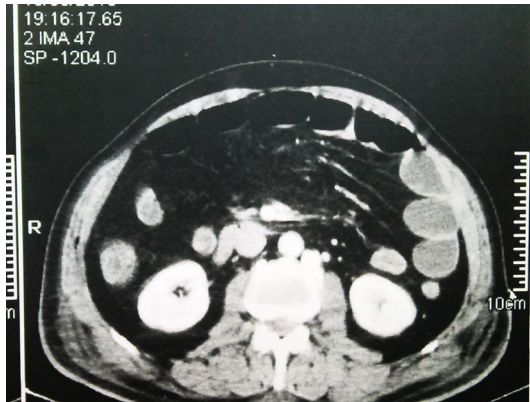
FIGURE 1: Thickened bowel walls and dilated fluid-filled bowel loops of an AMI patient on an abdominal CT image. AMI: acute mesenteric ischemia; CT: computerized tomography.

n is the number of nonmissing values; values in parentheses are percentages, except the mean ± SD *CPB: cardiopulmonary bypass, IABP: intra-aortic balloon pump, and MI: myocardial infarction.