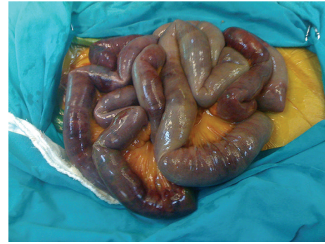
FIGURE 2: Intraoperative image of a gangrenous and necrotic bowel.

Among preoperative parameters, age ( P = 0.03 ), renal insufficiency ( P = 0.004 ), preoperative inotropic treatment >24 h ( P < 0.001 ), smoking ( P = 0.02 ), emergency cardiac surgery ( P = 0.01 ), PVD ( P = 0.04 ), LVEF <30 ( P = 0.002 ), cardiogenic shock ( P = 0.003 ), NYHA ( P = 0.006 ), and IABP