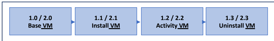
Figure 2: VM snapshots created on Linux and Windows machine running Minecraft server and client respectively

In order to prepare the installation snapshot on Windows (1.1), Minecraft was downloaded from the official site https://minecraft.net/en-us/download/ and installed to the default directory. A snapshot was taken at this stage and an attempt was made to ‘Play’, however it crashed due to a graphics adaptor issue. It was necessary to install VMWare Tools and to disable Windows Update to prevent changes to the system outside of the Minecraft installation.