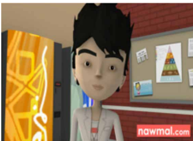
Figure 1: Audiovisual information 1

The slide also included audiovisual information in the form of an animated cartoon depicting the situation as well as the first turn that initiated the conversation produced by a native English speaker (see Figure 1). Participants were asked to a) imagine themselves in each situation, b) listen to the animated interlocutor's initiating turn, and c) provide an appropriate response in English. The social situations represented in the scenarios took into account two social variables: power and distance, which have been shown to be important variables in determining speech act performance (Brown and Levinson, 1987; Byon, 2004; Félix-Brasdefer, 2004; Rose, 2000). Distance was treated as binary-valued; either they knew one another (-) or did not know one another (+). The social power also considered two possible values: status equal (=) or speaker dominant (+). Gender of speakers in the initial turns was considered and varied randomly across all situations. However, the purpose of the study was not to investigate this variable. Table 3 presents a summary of the way in which each item varied by social power and social distance.