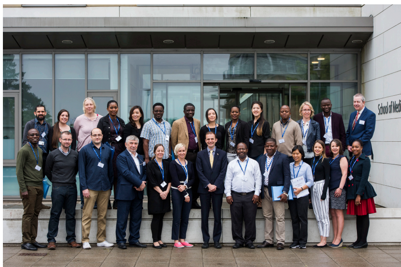
FIGURE 3. The Molecular Bacterial Load Assay (MBLA) Stakeholders Conference Delegates

Mycobacterial load was measured at baseline before the initiation of antituberculosis therapy and weekly during treatment. Each curve represents a patient. The red curve demonstrates the biphasic decline in mycobacterial load as patients responded to treatment. Note the steeper slope (fast rate of sputum clearance) in the first 2 weeks of treatment, and then a plateauing curve (slow rate of sputum clearance) in the later weeks of treatment.