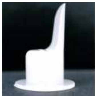
Figure 2.1. Scoop Feeder

their breasts to have close skin contact and to stimulate lactation. Babies may develop ulcers in the septum (e.g., the septum divides the walls of the nostrils) when the bottle's teat rubs on it, which can lead to bleeding in this area and discomfort for the babies. If this happens, it is best to switch to a scoop feeder (Figure 2.1) until the ulcer heals. Cooled-down boiled water can also be given to the baby after each feeding to clean the inside of the mouth. If the lip gets sore because of the feeding, moisturizing cream can be administered to soothe the lip (Cole, Tomlinson, Slator, & Reading, 2010).