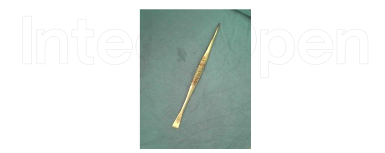
Fig. 4. Tonsil Dissector.

A frequently used method for total tonsillectomy is the "cold" or sharp dissection technique. In this technique, the tonsil and capsule are dissected from surrounding tissue using scissors, knife, or t dissector (Figure 4) and the inferior pole is amputated with a tonsil snare.