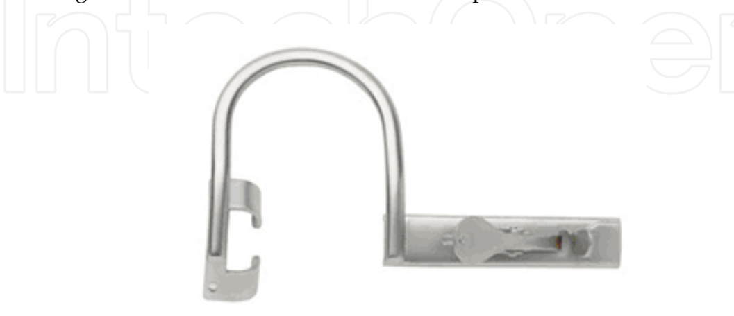
Fig. 2. Open-sided mouth gag (Davis Mouth Gag).

For a successful surgery, adequate exposure, of the oro-pharyn must be achieved. Also knowledge of the relevant anatomy and tissue tension is important. With the aid of a mouth gag, e.g, Boyle -Davis (Figure 2), the oropharynx is exposed. Dentition may be protected by a plastic or rubber athletic mouth guard and careful mouth gag placement. Care is taken not to allow the lateral flanges of the tongue blade of the gag to scratch dental enamel. Protection of the mucosa from electrical and thermal conductivity is achieved by interposing a gloved finger between the instrument metal and the patient.<sup>13</sup>