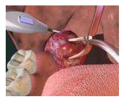
Fig. 3. Medial Traction on the Tonsil.

The tonsils are then removed using 1 of the techniques described later.