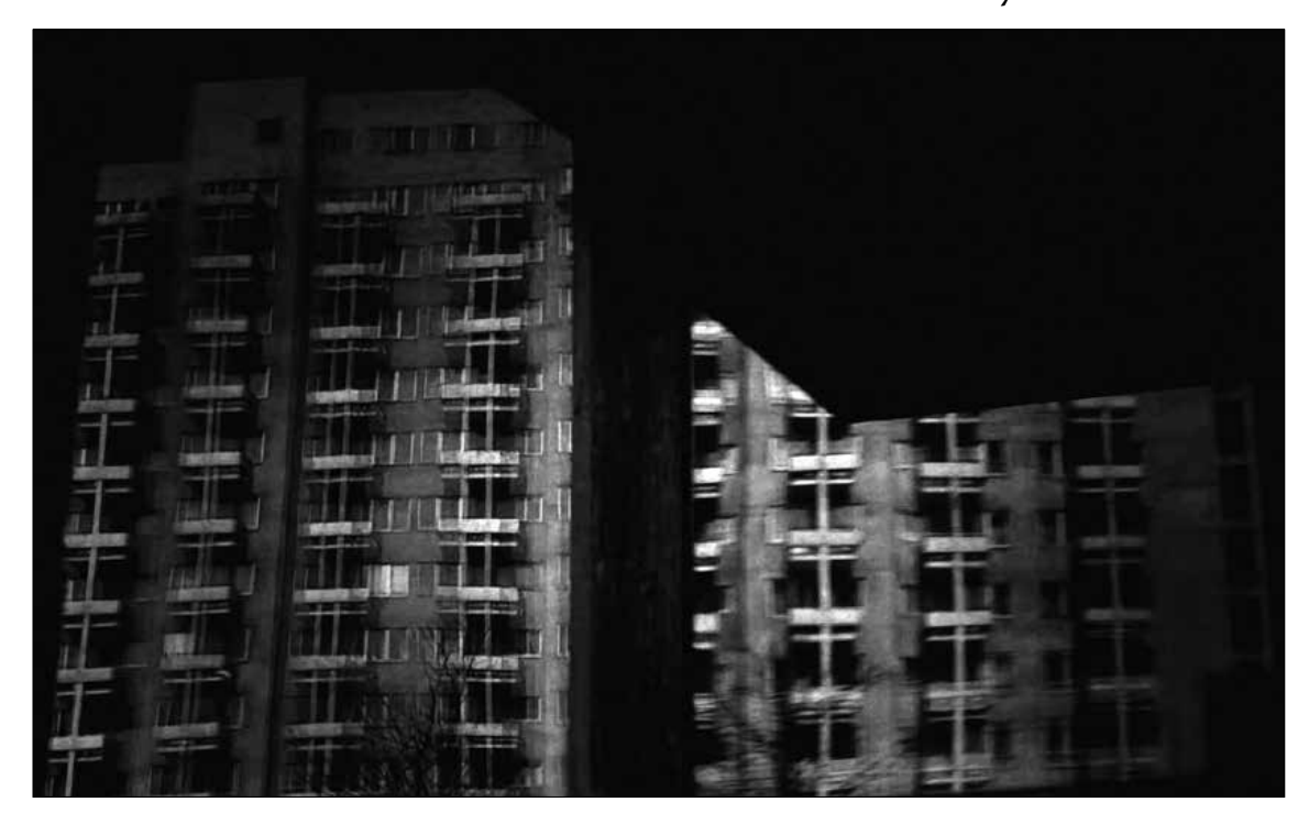
That is, until the notorious Waldemar swings open the door and disrupts everything.