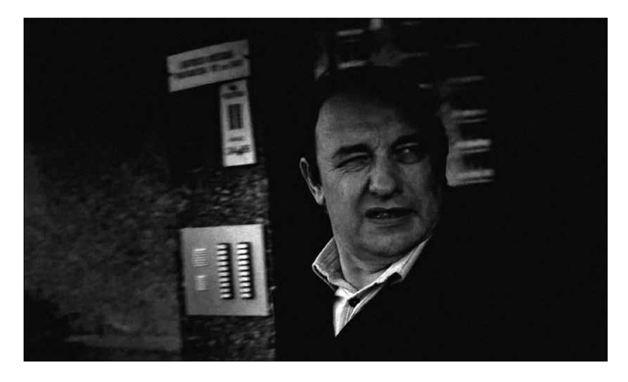
Perhaps I was not prepared to stand beneath these massive urban towers. I was dwarfed, exposed. Hitchcock was intrigued by the

Images XXIV - 1 kor.indd 27 2019-03-09 19:52:41