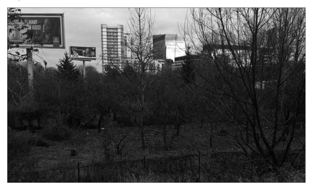
[8] G. Bruno, Atlas of Emotion: Journeys in Art, Architecture, and Film, op. cit., pp. 2–4.