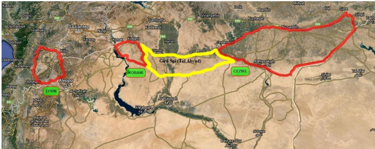
Figure 1: Rojava Democratic Autonomous Cantons (encircled in red) and the area taken by YPG (encircled in yellow) in June 2015