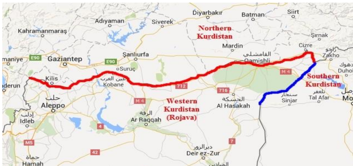
Figure 3: Rojava’s borders with northern (red) and southern (blue) Kurdistan

Kurds in Rojava (western Kurdistan) received important political, social, financial and military support mostly from Kurds in north Kurdistan. There are several reasons for that. First of all, Rojava has its longest border (Figure 3) 31 with northern Kurdistan where the PKK has been the main actor and its ideology has become the main motivation behind Kurdish mobilization in politics and armed struggle since early 1980s. Democratic Regions Party or the DBP (formerly BDP-Peace and Democracy Party) and People’s Democratic Party or the HDP in northern Kurdistan and Turkey have been sending humanitarian aids to Rojava since the very beginning of the civil war. Kurds who support the PKK in northern Kurdistan also