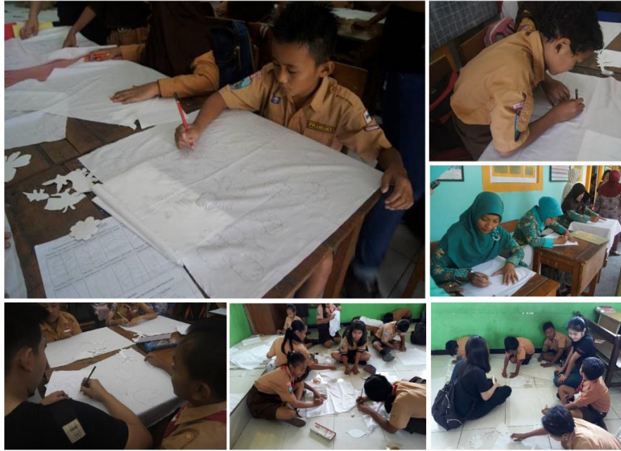
Figure 6 Stages of motif composition making on a piece of cloth using the model already prepared by the students. .

Batik training includes the transfer of knowledge/theory on batik integrated into batik making with simple techniques. The work of batik making starts from the application of wax on a piece of cloth by a pen-like tool called canting . The next step is the coloring with the Colet technique. The final step is the wax removal or locally known as nglorod . At the initial step of batik making, the traditional technique with canting was introduced to students. They practiced how to apply wax to the previously prepared motif composition. The tools and materials needed among others are 1) wax for nglowong ; 2) medium-sized canting to make motif outline or nglowong and small-sized canting for isen-isen (filling) or cecek (dots), or large-sized canting to give emphasis on the lines to be distinguished, 3) wax boiler and stove filled with kerosene, 4) hurdle for hanging the cloth.