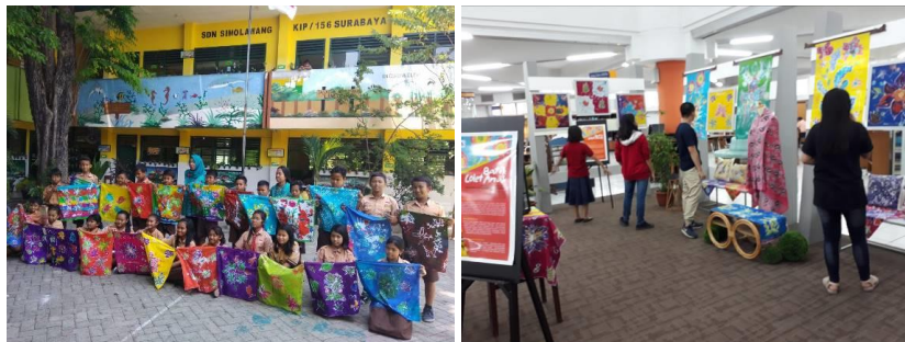
Figure 10 Joint exhibition as the final activity of the training to nurture the sense of pride among the students in the society.

The final activity was exhibition and joint work display. The exhibition is the final step in the training. Evaluation of the final works of the students revealed the display of student potentials as such as imagination, creation, and production of good works. This final step was an important moment for the students to show their personal existence and expression in the society. It was also intended to reveal students achievement to the society and to enhance self-confidence and self-awareness in one's potential (figure 10).