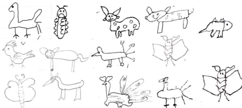
Figure 5 A number of sample animal motifs created by the students of Sekolah Dasar Sidodadi II and Sekolah Dasar Simolawang KIP 156. The students captured 3-dimensional shapes by their visual sense. Then they expressed them on a piece of drawing paper. They output was a two-dimensional shape. The shapes were the output of spontaneous expression, which was the specific characteristic of 10-year-old children.

In the design making, the teachers and facilitators assisted the students in identifying the uniqueness of their talents in a simple method. The tools and materials needed were only sample motifs made of paper, cotton cloth, and pencil (figure 6). In this training, two methods were applied. In the first method, the facilitators shared the motif already made by the students. Then they made a model with a piece of thick paper. Therefore, the students just made the composition on a piece of cloth based on the already prepared model. In the second model, the students made a motif with free composition on a piece of cloth. In the second method, the students were expected to have a free imagination and creation in a flexible time just like in the first method already practiced at school. Facilitators facilitated and divided the motif compositions into groups. The results of the activity indicated the students' eagerness in training. They were truly delighted and motivated.