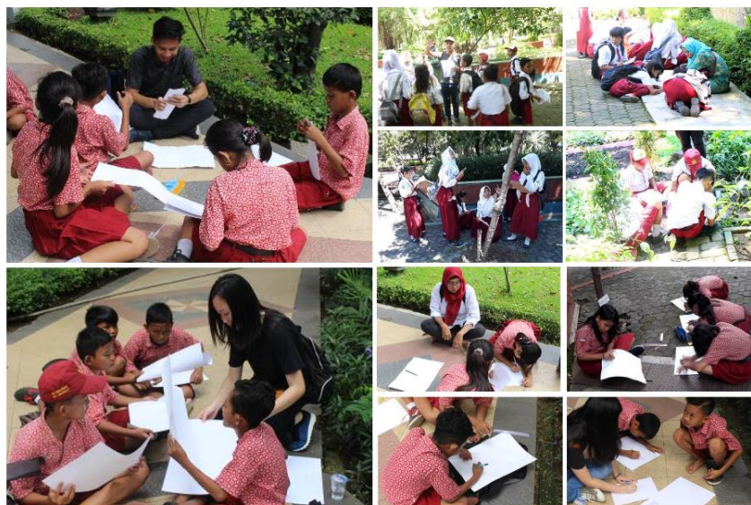
Figure 3 The students made motifs with the environment being their source of idea. They were facilitated by the facilitators and school teachers

The students also had another exploration activity in the city park of Surabaya. The objectives of this activity are to provide a learning medium and to explore the natural potentials in the development of batik motifs. Environmental exploration encourages students' creative sensitivity with the environment being the source of idea. The output of the exploration is the documentation of various motifs of flora and fauna. In the activity, each school was divided into small groups with one facilitator. The facilitators were the students of interior design department of Petra Christian University. The researchers ensured that the facilitators and school teachers facilitated the students in observing the trees, leaves, flowers, animals, and other natural objects that can potentially be resources for the development of batik motifs (stimulating the emergence of idea through observation of natural objects). When the students have observed various kinds of plants and animals in the park, the students created their own motif after discussing it with the group and the facilitator. They imitated and drew what they have observed based on their own imagination. The students observed, recorded, and identified the potential and characteristics of the objects. Furthermore, they identified, selected, drew, and created alternative motifs based on observation of nature.