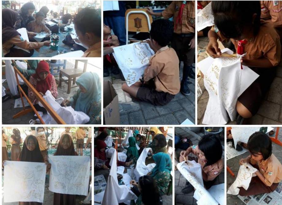
Figure 7 Stages of wax application on the textile with traditional batik painting using a canting . The students learn about perseverance, patience, meticulousness, and carefulness since they use hot wax.