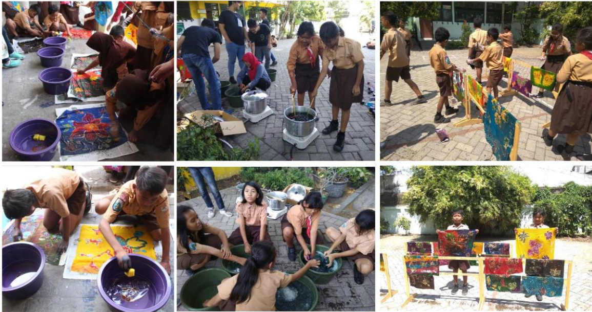
Figure 9 Fixation stage (the process of fixing the color to prevent from fading away) using water glass, removing the wax with boiling water, washing with cold water, and drying the batik.

The final activity was exhibition and joint work display. The exhibition is the final step in the training. Evaluation of the final works of the students revealed the display of student potentials as such as imagination, creation, and production of good works. This final step was an important moment for the students to show their personal existence and expression in the society. It was also intended to reveal students achievement to the society and to enhance self-confidence and self-awareness in one's potential (figure 10).