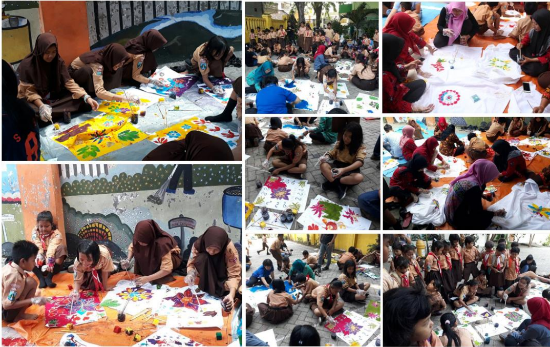
Figure 8 Coloring stage on the composition already made with the colet technique using a brush.

The evaluation of activities revealed that remazol paint is safe for children and hence for the primary school children. The process was simple and fast. It could be easily and practically applied like the usual process of batik making. Therefore, the colet process with remazol color did not require a new difficult technique. In addition, the color was bright. The real color would soon appear after the students apply the brush on the textile. This condition simplified the process of color composition making. The batik had a bright color and good quality. It was also economic and thus it is affordable to middle-to-lower groups. The application was also practical and simple. Water glass or sodium silicate was used for fixation or washing in order to ensure that the color did not fade. The selected colors for the colet process in the training were yellow, wine-red, Turkish blue, green, orange, violet, and pink. Meanwhile, the materials were size one and two oil paint brushes as the colet tools, cups to contain paint, foam to color large areas, cotton buds to color little motifs, and water glass for fixation.