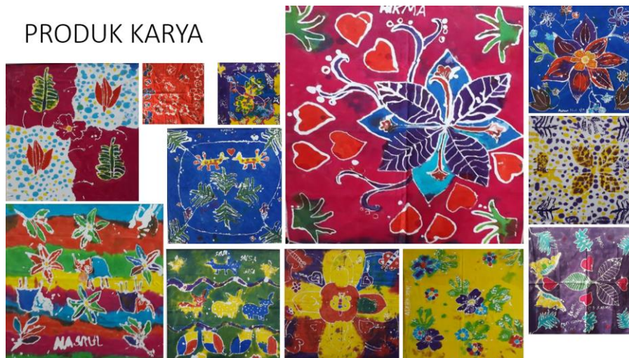
Figure 11 Students' final products representing the students' final expression in a free creation.

Overall, the evaluation results in batik training revealed positive outcomes of the students' intellectual development as summed up in table 1.