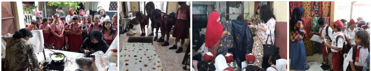
Figure 1 Students had a field exploration to the workshop of Batik Amri Jaya, Jetis, Sidoarjo, East Java - Indonesia. The students enthusiastically watched and listened to the explanation of traditional batik making process. This exploration is beneficial for the students to be able to appreciate the artisans' profession. In addition, it is also useful for the students in identifying traditional art and culture existing and developing in local societies.

Therefore, teachers had to prepare worksheets to be filled up by students when they have an outdoor learning activity. They are requested to report what they have observed. However, in spite of the possibility of inadequate data recording in students' memory (optimally or less optimally remembered), this initial activity is beneficial and useful as a warming up exercise to enhance the children's creativity (figure 2).