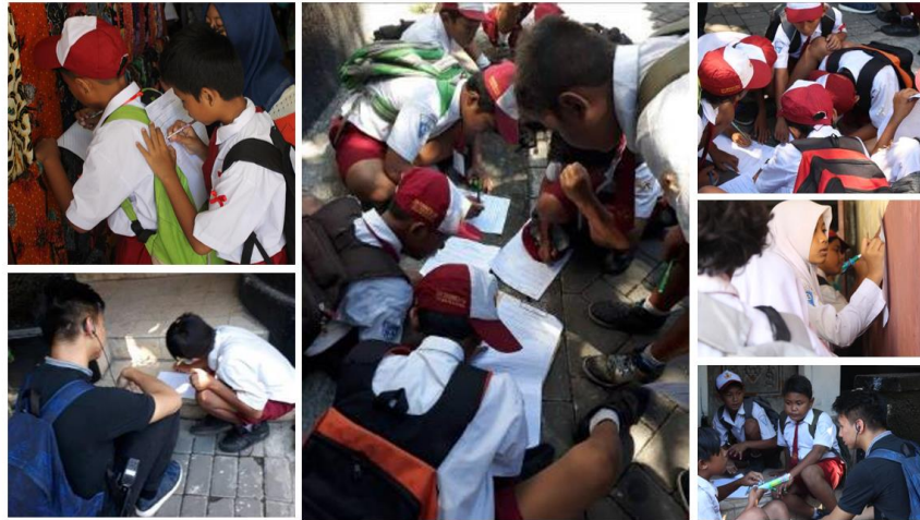
Figure 2 Students made a report in the batik artisans' workshop by filling up the worksheet prepared by the researcher to identify how much they can record the information provided by the artisans.

The students also had another exploration activity in the city park of Surabaya. The objectives of this activity are to provide a learning medium and to explore the natural potentials in the development of batik motifs. Environmental exploration encourages students' creative sensitivity with the environment being the source of idea. The output of the exploration is the documentation of various motifs of flora and fauna. In the activity, each school was divided into small groups with one facilitator. The facilitators were the students of interior design department of Petra Christian University. The researchers ensured that the facilitators and school teachers facilitated the students in observing the trees, leaves, flowers, animals, and other natural objects that can potentially be resources for the development of batik motifs (stimulating the emergence of idea through observation of natural objects). When the students have observed various kinds of plants and animals in the park, the students created their own motif after discussing it with the group and the facilitator. They imitated and drew what they have observed based on their own imagination. The students observed, recorded, and identified the potential and characteristics of the objects. Furthermore, they identified, selected, drew, and created alternative motifs based on observation of nature.