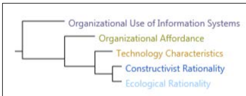
Figure 2. Cluster analysis based on coding similarity

We undertook cluster analysis of the 23 submission documents based on coding similarity to give us some indication of the proximity between categories. The result of the cluster analysis shows close proximity between constructivist and ecological rationalities (see Figure 2). We contend that this proximity implies that these two rationalities form the basis of analysing IS adoption decisions. Along with technological characteristics, these two rationalities are subordinate to the branch of organizational affordance. This finding is logically consistent with prior literature whereby collective rationalities among individuals within organizations facilitate rationalities to act on affordances with the technologies (Zammuto et al. 2007; Leonardi, 2011; Volkoff & Strong, 2013). To deepen our cluster analysis, we examine relevant coded sentences or paragraphs from the 23 submission documents associated with constructivist and ecological rationalities, technological characteristics, organizational affordance, and organizational use of information systems.