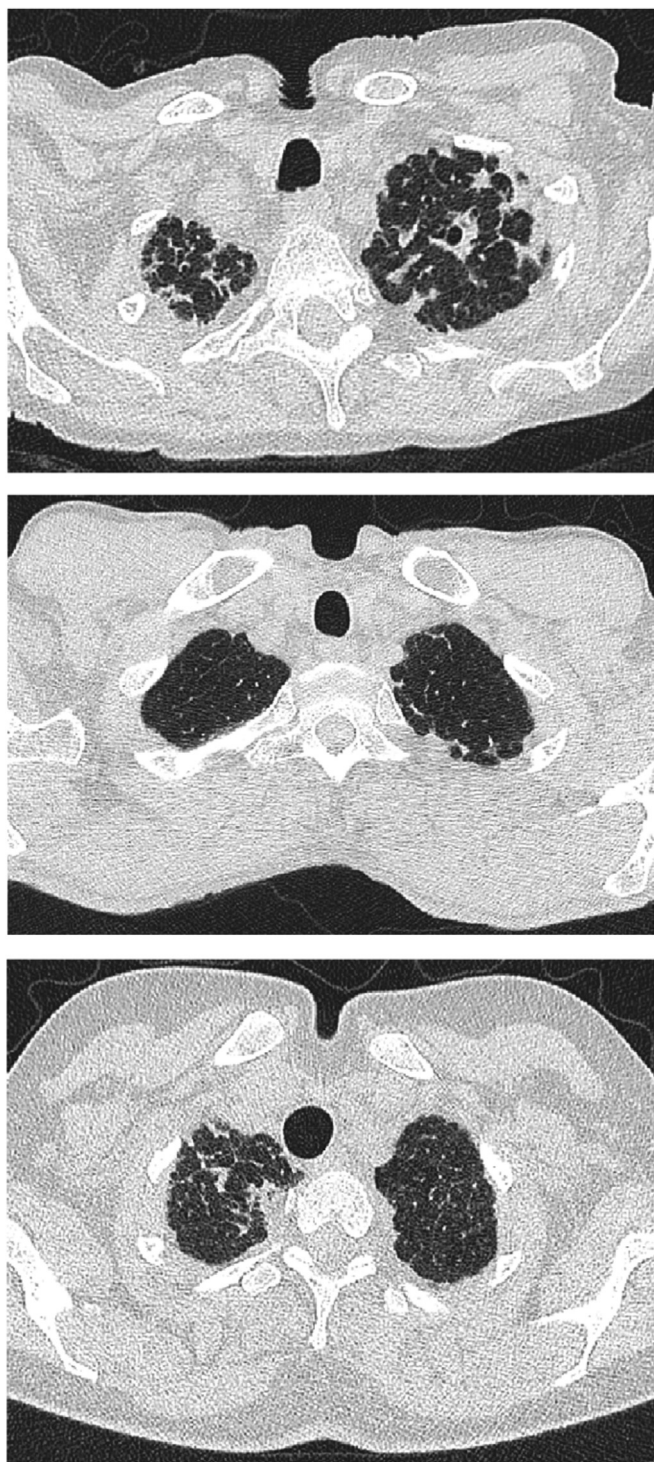
Fig. 1. Axial CT images demonstrating a midline suprasternal depression which was only ever seen in hypersensitivity pneumonitis patients with pleuroparenchymal fibroelastosis (PPFE). The depression was invariably visible between the clavicles, and was often accompanied by a concavity of the skin in the midline of the back at the same level. Fig. 1a highlights dense pleural and parenchymal aggregations of fibrous tissue in a 71-year-old female never-smoker exposed to avian antigens. Fig. 1b demonstrates PPFE in the left upper lobe in a 59-year-old, male, never-smoker exposed to avian antigens and mould, with a diagnosis of hypersensitivity pneumonitis confirmed on surgical lung biopsy. Fig. 1c demonstrates PPFE in the right upper lobe in a 43-year-old, female, never-smoker with farmers lung, with a diagnosis of hypersensitivity pneumonitis confirmed on surgical lung biopsy.

(17%) were treated with both immunosuppression and steroids.