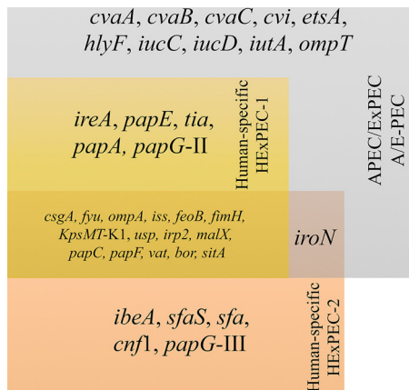
FIG 2 Diagram of ExPEC-associated gene distribution in the three groups; the two human ExPEC clusters HExPEC-1 and HExPEC-2 and the mixed avian/human ExPEC A/E-PEC cluster. Genes associated with the A/E-PEC are located in the gray box. HExPEC-1-associated genes are located in the yellow box. HExPEC-2-associated genes are located in the orange box.

The HExPEC-1 cluster was distinctly separated from the remaining genomes in both the SNP phylogeny and accessory-genome-derived tree, while the HExPEC-2 cluster demonstrated a clear separation only in the accessory-genome-derived tree. The HExPEC-1 was distinguishable from other strains by two canonical SNPs as well as several accessory genome features, while the HExPEC-2 cluster constituted a distinct subclade in the accessory genome, defined by the presence of two cut genes. The two canonical SNPs that differentiated the HExPEC-1 were both in the nicotinamide ribose kinase domain of the nadR gene and were both nonsynonymous. NadR is a trifunctional protein involved in regulation of NAD and associated fermentation pathways and