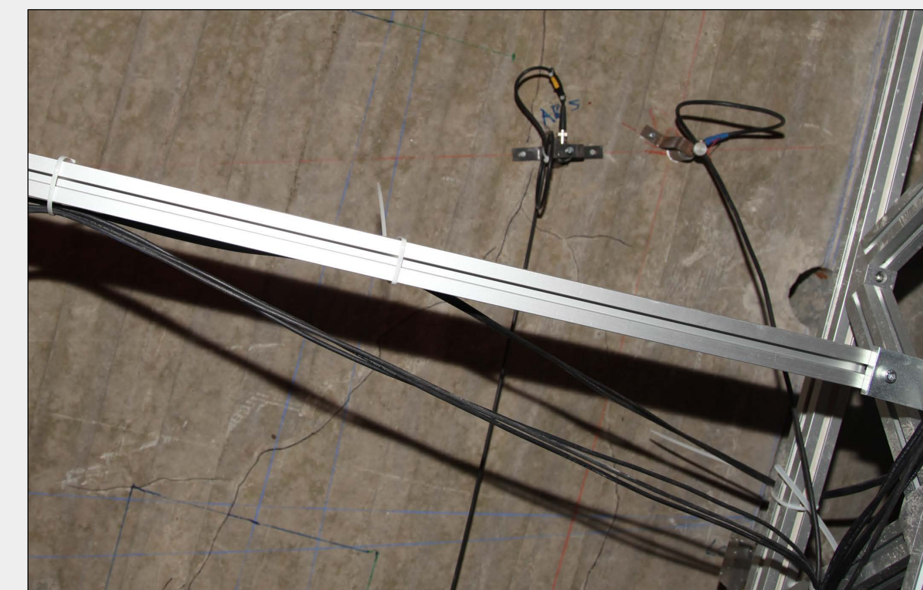
Figure 3 - AE sensor mounted on concrete surface [2].

The combination of DIC and AE is hypothesized to make it possible to simultaneously detect and monitor crack initiation, both internally and externally. This combination of the two measurement methods is deemed to provide a unique identification of relevant stop criterion thresholds. Consequently such information can provide input data for theoretical capacity evaluations as well as probabilistic approaches. In combination with other advanced monitoring methods, the combination of DIC and AE holds the potential to provide monitoring thresholds in In-situ Full-scale Concrete Bridge Testing.