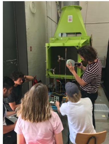
Figure 2: Participation of student groups in the practical work (Implement/Operate). Test rig used by each group during wind tunnel experiments.

Finally, the project plan, blade design and measured data will be written in a poster and presented at the exam session (figures 3 and 4). This poster will be the basis of the final, summative assessment (fail/pass). In the final assessment session each group member should be able to defend the entire poster.