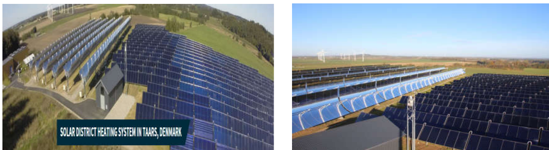
Fig.1. Overview of the flat plate and parabolic trough collector fields in Taars solar heating plant [2].

The number of large solar heating plants in Denmark has increased strongly during the last couples of years. Most solar collectors in the solar heating plants are flat plate collectors. The feasibility of parabolic trough collectors in solar heating plants has been investigated for Danish conditions [1]. A combined solar heating plant with a 5960 m 2 flat plate collector field and a 4032 m 2 parabolic trough collector field has been in operation in Taars since August 2015 [2], see Figs.1-2. The flat plate collectors preheat the return water from the district heating network to about 75°C, then the parabolic trough collectors heat the preheated water from the flat plate collector field to the required supply temperature of the district heating network.