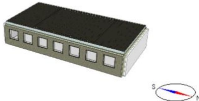
Figure 1. IDA ICE model of the call center with external facade facing east.