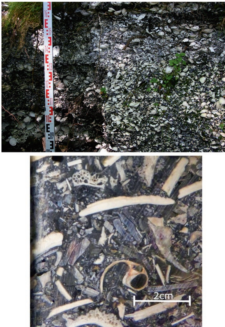
Fig. 21.2 (top) Shell midden excavation in progress from the Salish Sea, southern British Columbia.; (bottom) Intact sediment block from a shell midden embedded with fiberglass resin, north Calvert Island, British Columbia, Canada.