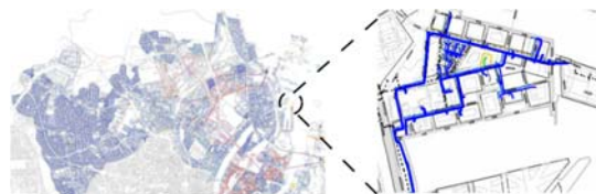
Fig 2. Field demonstration