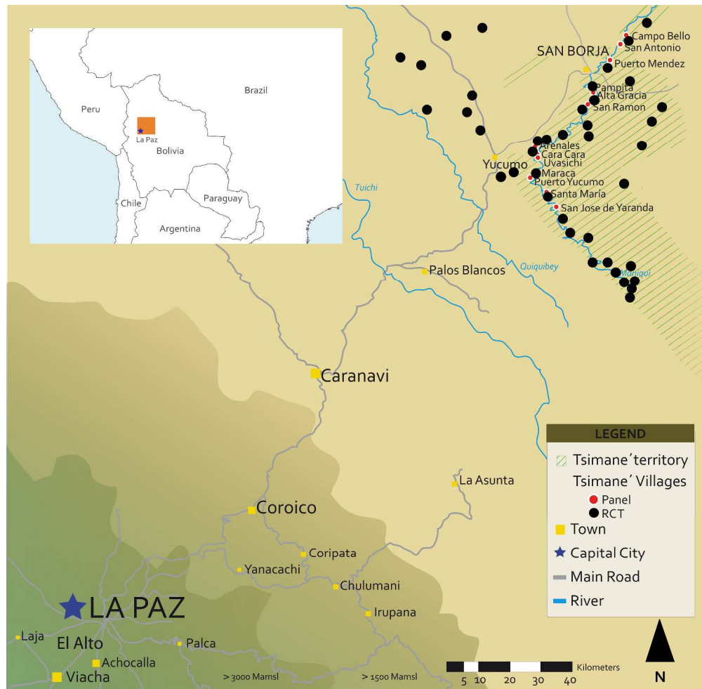
Figure 1. Map showing location of [1] 13 Tsimane' villages of the nine-year (2002-2010) annual panel study along the Maniqui River and [2] 40 additional Tsimane' villages of the randomized controlled trial (RCT), both in the department of Beni, Bolivia

Notes: The shading of the territory denotes elevation (Mamsl = meters above sea level). The square symbols and letters in each town are approximately proportional in size to the population of the town. The Tsimane' territory is an administrative division and does not capture all the lands inhabited by the Tsimane'.