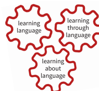
Figure 1. Halliday’s model of learning

CLIL fits well with powerful language learning theories and, in general, with theories that acknowledge the role that language plays in all learning. In this respect, Halliday (1993) presents a complex perspective of learning in general, and language learning in particular, which consists of a continuum of three main interdependent processes: learning language , learning through language and learning about language (see Figure 1 ):