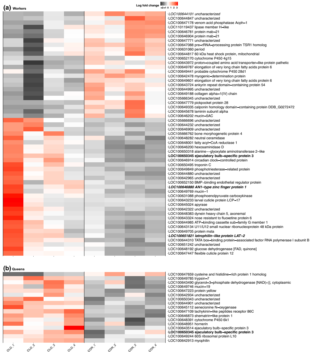
FIGURE 1 Chronic clothianidin exposure leads to gene expression changes in bumblebee workers and queens. Heatmaps displaying genes differentially expressed in workers (a; n = 55 ) and in queens (b; n = 17 ) between clothianidin-exposed and control colonies. For each differentially expressed gene, we show the log fold change for each biological replicate, as well as the gene identifier and NCBI's functional gene description. The single gene differentially expressed in both castes is indicated in bold. The single gene also differentially expressed in imidacloprid-exposed workers is indicated in italics. The two genes identified to be differentially expressed and alternatively spliced within clothianidin-exposed workers are indicated in bold and italics

identified >80% of these statistically significant genes with DESeq2 when using gene-level counts generated by the HISAT2-HTSeq pipeline as input. Similar to the kallisto-based analysis, the HISAT2-based approach identified caste- and pesticide-specific changes in bumblebee gene expression. Using this approach, we identified greater amplitude changes in gene expression in workers in comparison with queens. In addition, for both castes, clothianidin exposure resulted in greater gene expression changes than imidacloprid. Additional information on the specific findings of this comparative analysis is provided in the Supplemental Information.