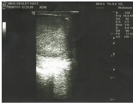
FIGURE 1: The scrotal color Doppler US image of a patient with BEO.