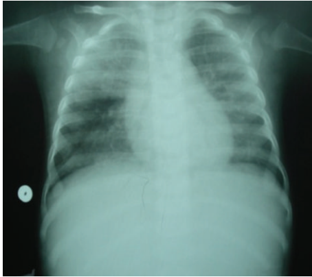
FIGURE 1: Chest X-ray: bilateral alveolointerstitial infiltrate.