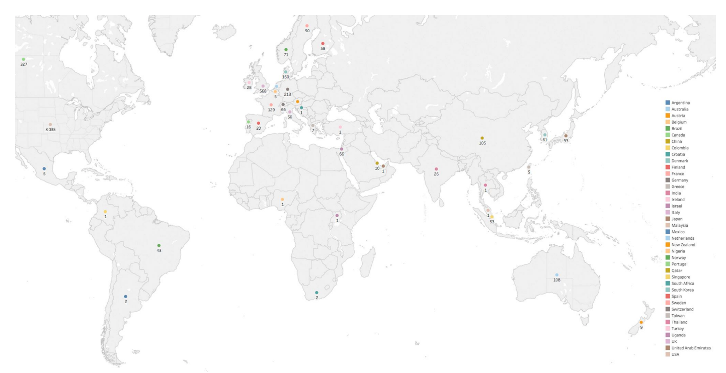
Fig. 2. Geographical distribution of the accumulated contribution.

Despite the highly interdisciplinary nature of CSCW, our study provides further evidence for situations in which research collaborations take place among organizations located in the same country with a reduced number of outside connections. According to Milard and Tanguy [28], "citations of co-workers from the same lab tend to be repeated more often". It is worth noting that most of the international collaborations in this study involve only one author from an external institution.