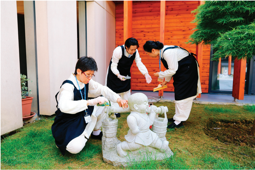
Figure 7. Preceptees carry out chores, carefully cleaning a Buddha statue and other garden ornaments at the Fo Guang Shan European Headquarters, Fahua Temple, Bussy-Saint-Georges, near Paris, 2018.

And neither is it the case, as Robbins's interpretation of ritual as transcendence might suggest, that this religiously inspired ethical pedagogy proceeds principally through an experience in ritual of perfected ideals, that is, through an (albeit fleeting) attempt to manifest the transcendent, "realizing one or a few values very fully" (Robbins 2015, 28). If that were the aim, the retreat would be constructed differently. As in much liturgical ritual, mistakes and missteps would be simply ignored, with only the successful completion of prescribed actions acknowledged as having occurred at all (Humphrey and Laidlaw 1994; Seligman et al. 2008). Instead, the conditions are such that chronic, repeated failure becomes inevitable and salient.