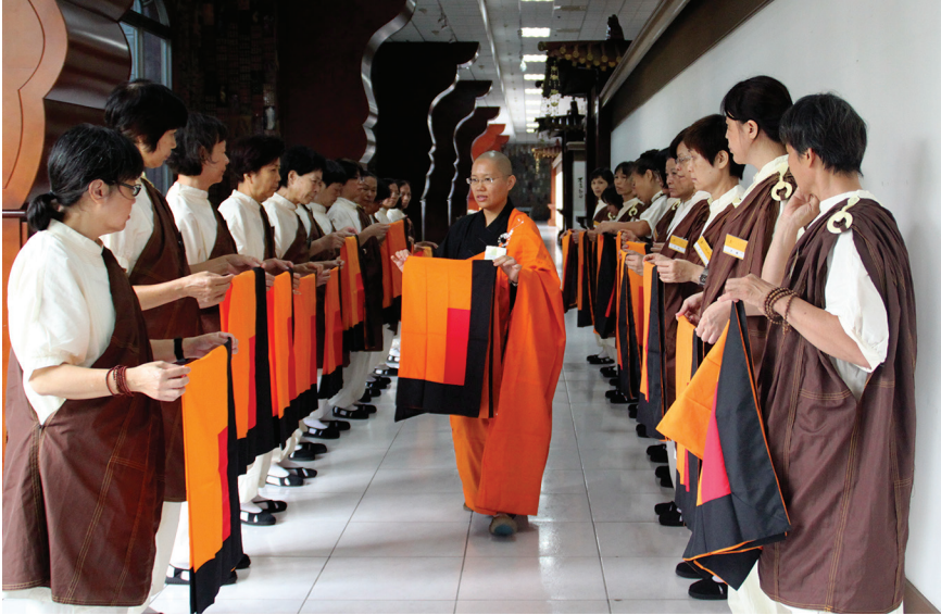
Figure 4. A guiding venerable shows a class of new preceptees how to fold the sitting mat, Fo Guang Shan Headquarters, 2016.

Returning to their dormitories before breakfast, ordinands are issued with a new monastic name, which is used from now on and replaces their lay name on their lanyards. This day continues with more training and rehearsal, as well as lectures on the meaning of the Precepts, and ends with a lengthy rite of repentance, with many prostrations that leave ordinands sweating and exhausted but spiritually ready on the third morning for the last of the four opening ceremonies, conferring the Precepts (傳受戒; chuanshoujie ).