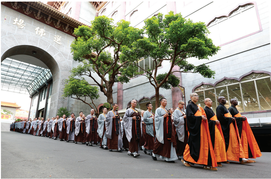
Figure 5. Preceptees walk in formation behind their guiding venerables. They are wearing the jiasha robe, holding the sitting mat before them, and carrying the alms bowl in a bag worn over the shoulder. Fo Guang Shan Headquarters, 2016.

Internal monitoring means focusing on the mind to identify and try to remove afflictions (煩惱; fannaο ), especially greed (執著; zhizhuο ) and the spirit of comparison (比較; bijiao ). Monastics frequently emphasize that this internal renunciation with the mind (心出家; xin chujia ) is as important as the external renunciation with the body (身出家; shen chujia ). They are causally linked because