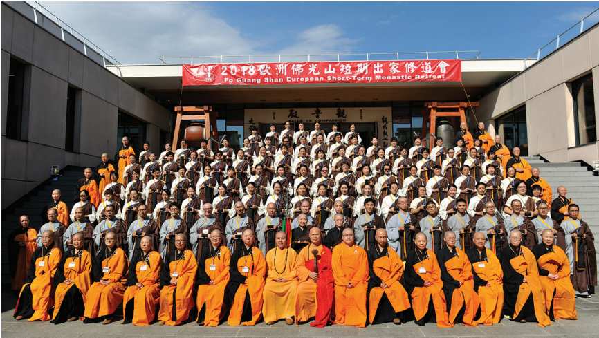
Figure 8. Preceptees and monastics pose for a group photo after the conferring the precepts ritual, Fo Guang Shan European Headquarters, 2018.

Many participants claimed lasting changes in their everyday life—if not becoming fully vegetarian, then moving in that direction, or reducing alcohol consumption, or refraining from killing insects. Others reported more dramatic changes. One young Singaporean woman went home, packed four boxes of clothes and shoes to give to the Salvation Army, and quit her job with an airline. After volunteering at a temple in the Philippines for some time, she started a new career as a charity fundraiser. “Oh,” she added, “and I gave up drinking coffee.” Others found they were unable to sustain the self-improvement they felt during the retreat for very long afterward, and some of those used imagery of needing to be “recharged.” Perhaps thinking back to the retreat and how one felt then might help? Others concluded that they had to undergo it again.