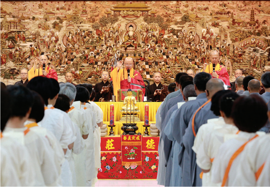
Figure 2. The witnessing master welcomes new preceptees at the conferring the precepts ritual in the main shrine room, Fo Guang Shan Headquarters, 2016.

posture or learning to appreciate tea, and these things are absolutely of a piece with learning to live harmoniously with other people. This may surprise people used to speaking about ethics in the restricted sense of the morality system, just as it is surprising to read in the Nicomachean Ethics that a quick wit is as much a virtue as courage or generosity.