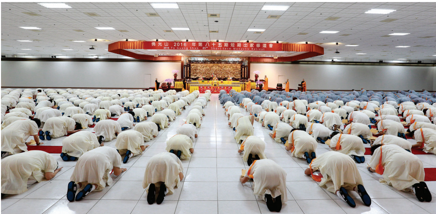
Figure 1. Preceptees prostrate in the main shrine room at Fo Guang Shan Headquarters, Kaohsiung, Taiwan, 2016.

Understanding how this process works not only provides insight into this influential form of Buddhism but also proves instructive for anthropologists seeking to understand the ways in which people strive to live well—that is, ethics, broadly understood. Over the past couple of decades, many anthropologists have come to