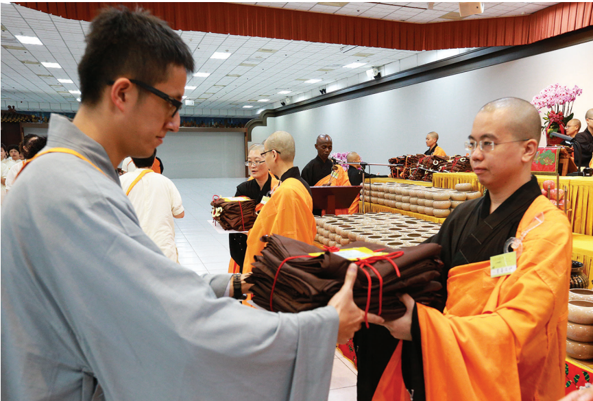
Figure 3. New preceptees are given robes, alms bowls, and sitting mats at the conferring the precepts ritual, Fo Guang Shan Headquarters, 2016.

By lunchtime on the first day, participants have arrived, registered, and moved into their dormitories. They pay a modest fee (and many also make voluntary donations), 1 and they receive an information pack and clothes. Men receive two pairs of cotton trousers, two long cotton tunics (中掛; zhonggua ), and two sets of thick cotton stockings, worn with garters. Each participant also receives an apron and sleeve coverings for chores, and a set of more sacred items. The first of these is the haiqing (海青), a high-collared, ankle-length, gray-blue tunic with capacious sleeves that serve as pockets. The haiqing is worn at all times outside one's dormitory except for physical work and walking meditation, and it must be removed and folded correctly before entering a bathroom. Then there is the ju (具), a colored cloth used as a liturgical sitting mat, and a small bag with a shoulder strap used for carrying an alms bowl. Men receive a jiasha (袈裟), a long