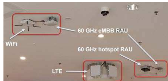
Fig. 1: RAU Installations for 3G/ 4G/ 5G mobile access.

For the field trial in the large Blue City shopping mall in Warsaw, a DAS has been developed and installed. It provides fiber-optic connectivity to all RAUs installed at the ceiling of the public area in the shopping mall as shown in Fig. 1.