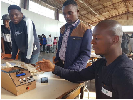
Figure 7: A participant demonstrates his team's PCR machine. This team won the prize for best documentation