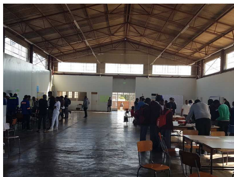
Figure 2: Inside the hall used for equipment demonstrations during the pilot LabHack event