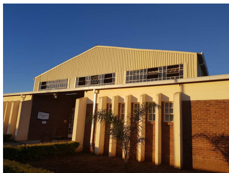
Figure 1: Harare Institute of Technology: the venue for the pilot LabHack event in Zimbabwe