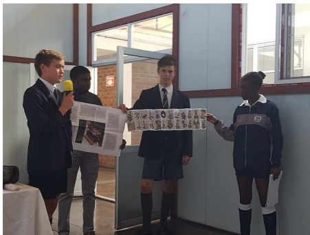
Figure 6: Participants present and describe their work

to build their own versions of the equipment. The LabHack therefore aims to foster both immediate and long term impact. It serves as an educational and motivational opportunity for participating students, who are encouraged to learn about the design and building of laboratory equipment, work collaboratively and apply creative thinking to their challenge. It also seeks to empower students and educators to address equipment shortages in learning environments, increase awareness of the Open Hardware movement and facilitate the cooperative sharing of designs and ideas. We envisage the LabHack as an ongoing and self-sustaining process to be applied whenever there is some equipment need, hence its representation in Figure 5 as a cycle.