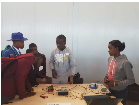
Figure 11: A team presenting their prototype