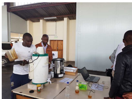
Figure 10: A team presenting their prototype bioreactor

designs. The longer creation phase also offers an extended learning period during which participants can develop the skills necessary for building their prototypes. Furthermore, it means that design documents can be submitted in advance of the event providing judges with more time to assess the teams. Finally, less time is required for prototype creation during the event meaning that much of the schedule can be dedicated to learning sessions. To assist with prototype creation, each team was provided with an Arduino kit. We also encouraged participants to visit our website, where we provided links to various support sources on Open Hardware, Raspberry Pi/Arduino projects and more.