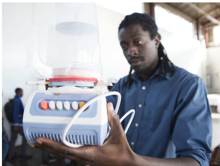
Figure 8: The team that won the prize for most frugal design built a centrifuge from a food mixer.