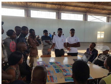
Figure 3: At the LabHack, participants join a workshop session on using an Arduino, which was run by a local start-up company

Within Africa, hackathons enable members of the public to engage with technology. There have been hackathons on social issues such as the developing sustainable bioinformatics capacity [2], as well as topics including cybersecurity [5]. As hackathons have grown in popularity in Africa, so too has the Open Hardware movement. The Africa Open Science and Hardware Summit [1], which aims to create a community of individuals from across society interested in Open Science and Hardware, is a good example of this. There has also been research in this area examining the challenges researchers face and more broadly, the accessibility of scientific research in Africa [3]. Our work takes a novel approach in combining these two fields in order to address real-world sociotechnical issues.