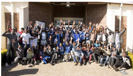
Figure 12: LabHack Zimbabwe 2018 group photo.