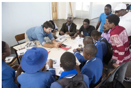
Figure 9: Participants take part in a session on building a $10 microscope. The session was run by event collaborator Andre Maia Chagas.