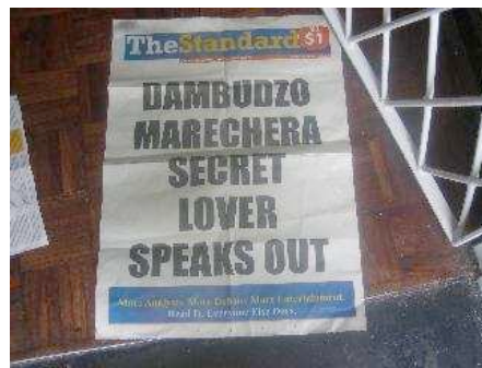
A newspaper banner in Zimbabwe