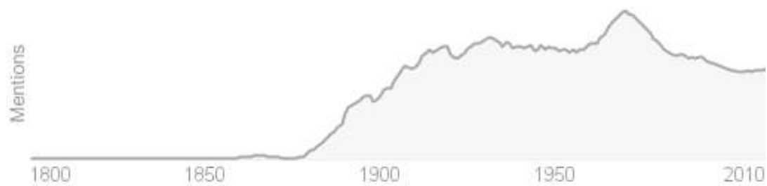
Use over time for: anarchism

Noun: 1. Belief in the abolition of all government and the organization of society on a voluntary, cooperative basis without recourse to force or compulsion 2. Anarchists as a political force or movement.