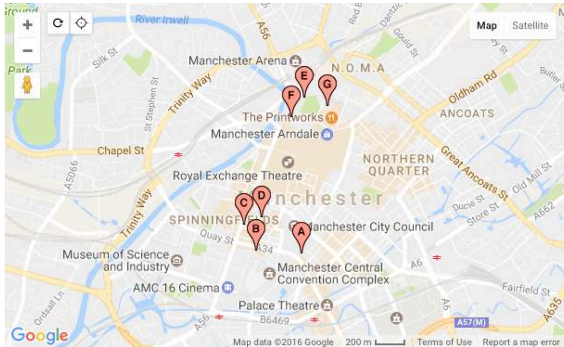
Walking tour of Manchester sites linked to the 1819 Peterloo massacre 17

I therefore set out to seek whatever Marecheraic qualities he had. To imagine that someone like Shelley lived centuries before and in another world fascinated me. I found Shelley's restless and demanding presence enamoring. Then there was Shelley's conscious craftsmanship, his disciplined originality in handling and reworking traditional forms and the striking modernity that distinguished his work from his Romantic peers. I travelled with him in his solitary journeys from England to Ireland to Wales all the way into the Italian landscape and as I read more about his tragic existence and discovered the complex beauty of his poetry I enjoyed the sense of poetic adventure in his words and imagination, his sense of energy and intellectual power. 18 Shelley's life story was just as colourful and exciting as