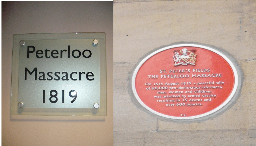
Plaques of the Peterloo site in Manchester

Indeed, it seems Shelley's masquerade did not end with his exposure of Castlereagh, Eldon, Sidmouth but the political actors have changed masks into Thatcher, Whitelaw, Webster, Howe as Marechera reveals and the nature of the problems have changed too. The similarities in the poems are strikingly remarkable – both are dealing with topical and very shattering issues (the Peterloo massacres and the Brixton race riots); in fact, the problems that Shelley was dealing with are no longer just local but, as Marechera highlights, global. Perhaps, the irony of it all is a home secretary with the most apt name – David Whitelaw, who was responsible for the heavy-handed policing of ethnic minorities and immigrants (notably the application of the sus laws). Marechera poses a question: