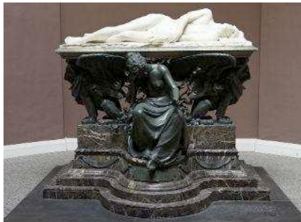
Shelley Memorial at Oxford 99

It is very clear that Marechera knew about Shelley's expulsion before his own expulsion. He could also have seen, or been to the Shelley Memorial at University College.