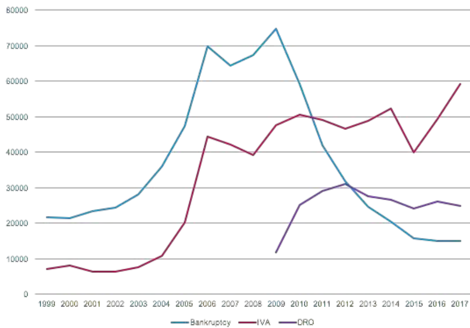
Figure 1: Bankruptcy, IVAs, (1999-2017), Debt Relief Orders (2009-2017)