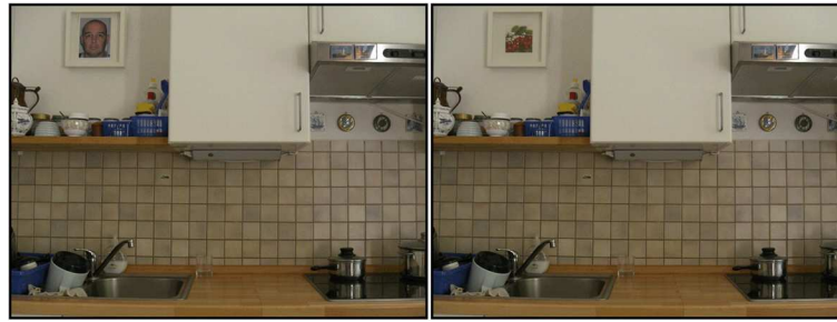
Fig. 1 Example stimuli from the face detection task, depicting a target-present (left) and target-absent (right) stimulus display

scene, which was presented on screen for 200 ms, followed by a blank display until a response was registered. Observers were instructed at the beginning of the task that each image would be shown briefly and were asked to respond as quickly and as accurately as possible.