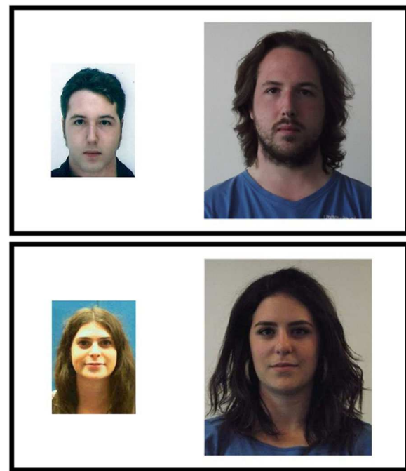
Fig. 2 Example stimuli from the Kent Face Matching Test (KFMT; Fysh & Bindemann, 2018). The top pair depicts an identity match, whereas the bottom pair depicts an identity mismatch

asked to identify the target from a three-face array containing two distractor images alongside the studied identity. In the second block, six different but concurrent faces were studied for 20 s. Observers were then presented with a series of three-face arrays containing one target face and two distractor identities and were required to select which face was previously studied. The third block of the task was conceptually similar to the second block, but with the addition of Gaussian noise on top of face images, to further increase the difficulty of the task. In the final block, observers were presented with 30 additional trials that feature heavily degraded face images varying in expression and pose. Example stimuli from each block are displayed in Fig. 3.